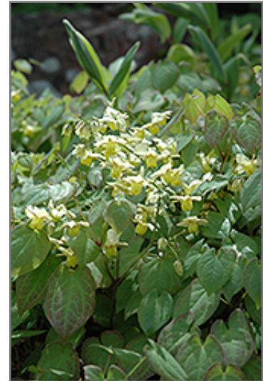
Yellow Barrenwort flowers

Yellow Barrenwort is recommended for the following landscape applications;