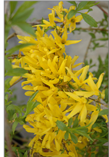
Gold Tide Forsythia flowers

This is a relatively low maintenance shrub, and should only be pruned after flowering to avoid removing any of the current season's flowers. Deer don't particularly care for this plant and will usually leave it alone in favor of tastier treats. It has no significant negative characteristics.