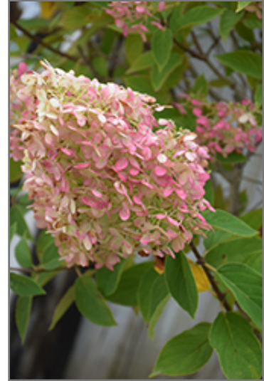
Limelight Hydrangea flowers (faded)

This shrub performs well in both full sun and full shade. It prefers to grow in average to moist conditions, and shouldn't be allowed to dry out. It is not particular as to soil type or pH. It is highly tolerant of urban pollution and will even thrive in inner city environments. Consider applying a thick mulch around the root zone in winter to protect it in exposed locations or colder microclimates. This is a selected variety of a species not originally from North America.