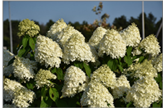
Limelight Hydrangea flowers

Limelight Hydrangea is recommended for the following landscape applications;