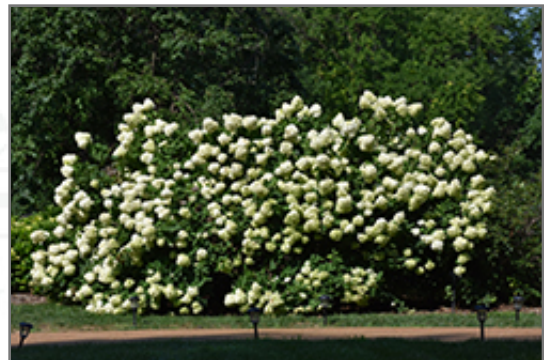
Limelight Hydrangea in bloom