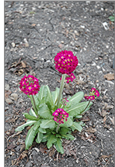
Ronsdorf Mix Purple Primrose in bloom

Ronsdorf Mix Purple Primrose features delicate panicles of purple star-shaped flowers with yellow eyes at the ends of the stems in early spring. Its small serrated oval leaves remain lime green in colour throughout the season.