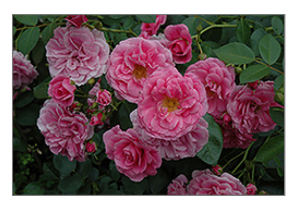
Felix Leclerc Rose flowers

From the brand new Canadian Artists series, this larger rose features large double rich pink blooms over a long season, can be trained as a climber or grow as a shrub; all roses need full sun and well-drained soil