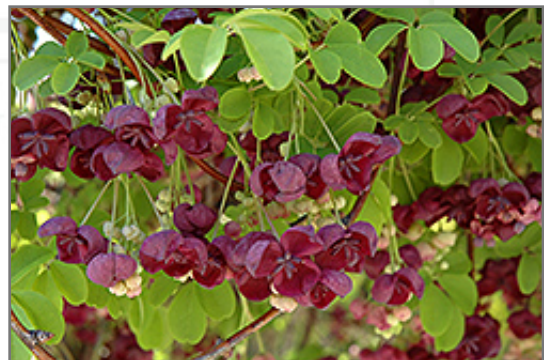
Fiveleaf Akebia flowers