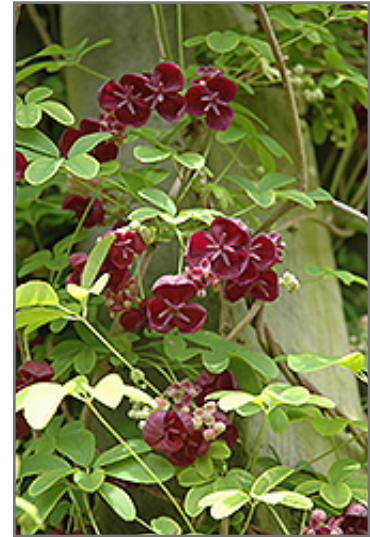
Fiveleaf Akebia flowers

Fiveleaf Akebia is a multi-stemmed deciduous woody vine with a twining and trailing habit of growth. Its relatively fine texture sets it apart from other landscape plants with less refined foliage.