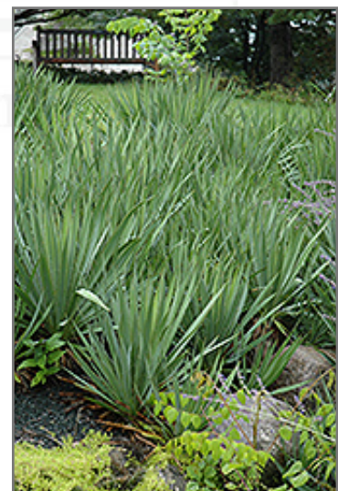
Adam's Needle