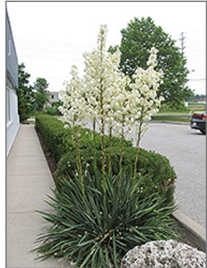
Adam's Needle in bloom