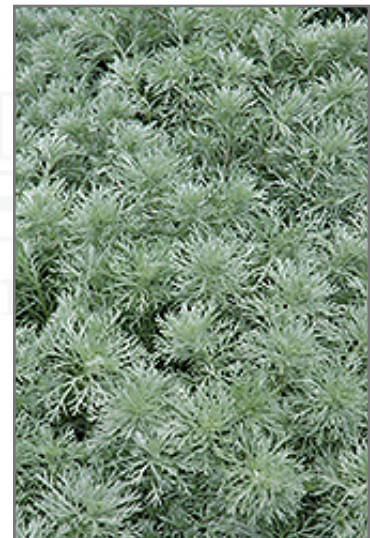
Silver Mound Artemisia foliage