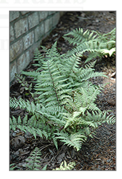
Ghost Fern