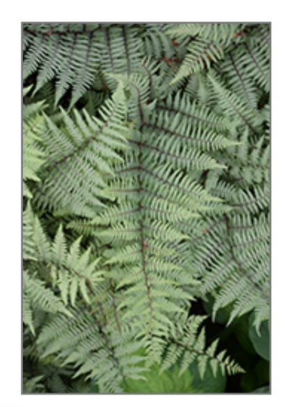
Ghost Fern foliage

Ghost Fern is recommended for the following landscape applications;