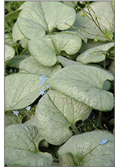
Looking Glass Bugloss foliage

Silver heart shaped foliage create a unique addition to containers, borders and garden landscapes; a shade loving mounded variety that is easy to grow, requiring little to no maintenance; sky blue flowers emerge during the late spring months