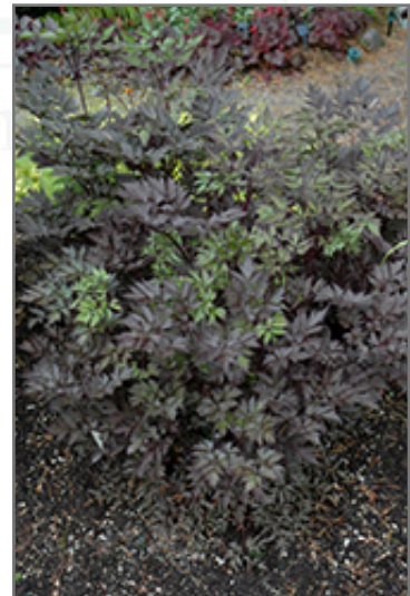
Black Negligee Bugbane