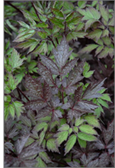
Black Negligee Bugbane foliage

This is a relatively low maintenance plant, and should be cut back in late fall in preparation for winter. It has no significant negative characteristics.