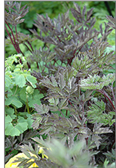
Hillside Black Beauty Bugbane

Hillside Black Beauty Bugbane is recommended for the following landscape applications;