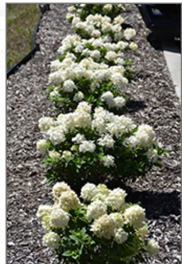
Tiny Quick Fire Hydrangea in bloom