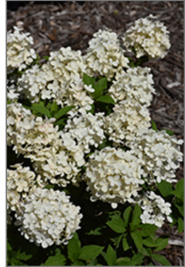
Tiny Quick Fire Hydrangea flowers