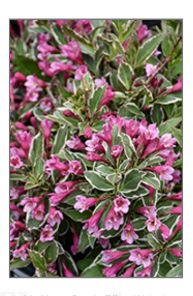
My Monet Purple Effect Weigela flowers

This shrub will require occasional maintenance and upkeep, and should only be pruned after flowering to avoid removing any of the current season's flowers. It is a good choice for attracting hummingbirds to your yard. It has no significant negative characteristics.