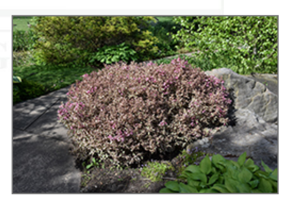
My Monet Purple Effect Weigela in bloom