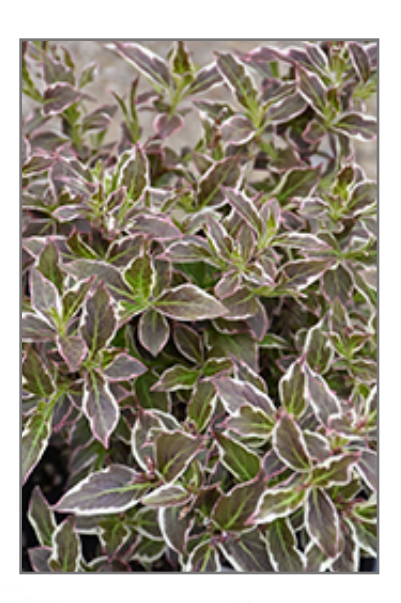
My Monet Purple Effect Weigela foliage

This shrub should only be grown in full sunlight. It prefers to grow in average to moist conditions, and shouldn't be allowed to dry out. To help this plant achive its best flowering performance, periodically apply a flower-boosting fertilizer from early spring through into the active growing season. It is not particular as to soil type or pH. It is highly tolerant of urban pollution and will even thrive in inner city environments. This is a selected variety of a species not originally from North America.