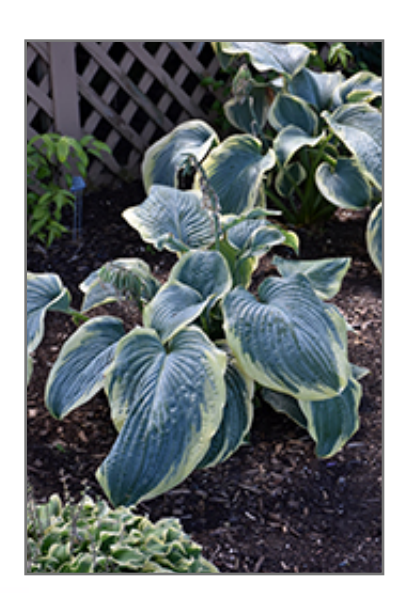
Gigantosaurus Hosta

A beautiful extra large variety featuring dense mounds of powder blue, heart shaped leaves with creamy white margins; lavender flowers appear in mid-summer; adds texture, contrast and color to garden beds; prefers shaded areas