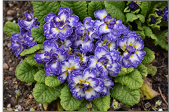
BELARINA Blue Ripples Primrose in bloom