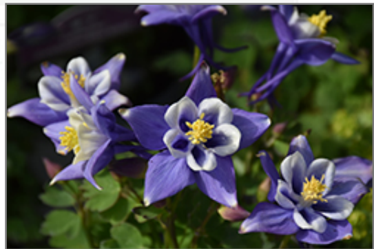
Earlybird Blue and White Columbine flowers