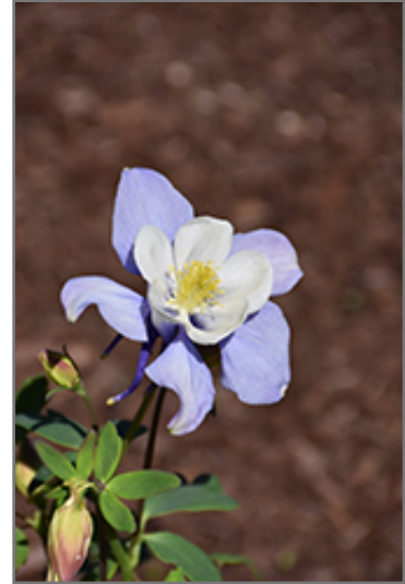
Earlybird Blue and White Columbine flowers

Earlybird Blue and White Columbine is an herbaceous perennial with a mounded form. Its relatively fine texture sets it apart from other garden plants with less refined foliage.