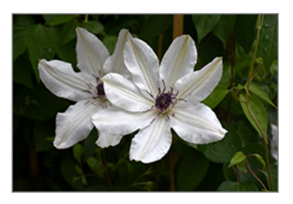
Vancouver Fragrant Star Clematis flowers

Vancouver Fragrant Star Clematis is a multi-stemmed deciduous woody vine with a twining and trailing habit of growth. Its average texture blends into the landscape, but can be balanced by one or two finer or coarser trees or shrubs for an effective composition.