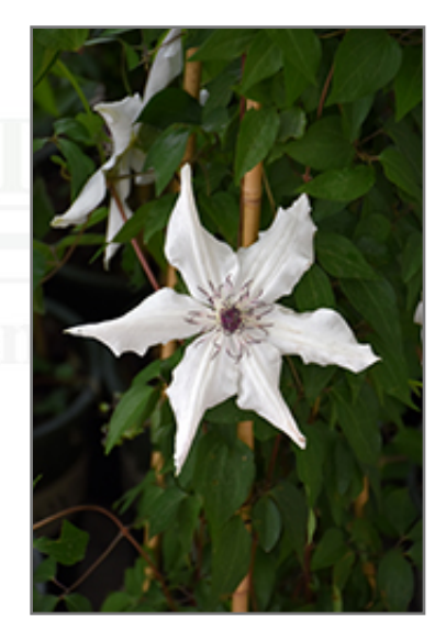
Vancouver Fragrant Star Clematis flowers