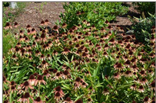
Fiery Meadow Mama Coneflower flowers