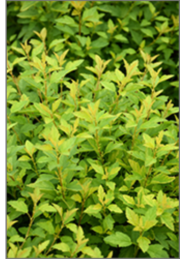
Raspberry Lemonade Ninebark foliage

This shrub will require occasional maintenance and upkeep, and can be pruned at anytime. It has no significant negative characteristics.