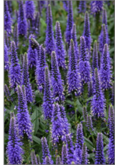
Skyward Blue Long-leaf Speedwell flowers

Skyward Blue Long-leaf Speedwell is recommended for the following landscape applications;