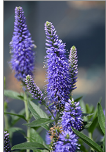
Skyward Blue Long-leaf Speedwell flowers

Skyward Blue Long-leaf Speedwell is a fine choice for the garden, but it is also a good selection for planting in outdoor pots and containers. It is often used as a 'filler' in the 'spiller-thriller-filler' container combination, providing a mass of flowers against which the larger thriller plants stand out. Note that when growing plants in outdoor containers and baskets, they may require more frequent waterings than they would in the yard or garden. Be aware that in our climate, most plants cannot be expected to survive the winter if left in containers outdoors, and this plant is no exception. Contact our experts for more information on how to protect it over the winter months.