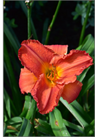
South Seas Daylily flowers

This is a relatively low maintenance plant, and is best cleaned up in early spring before it resumes active growth for the season. It is a good choice for attracting butterflies to your yard. It has no significant negative characteristics.