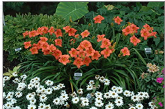
South Seas Daylily in bloom