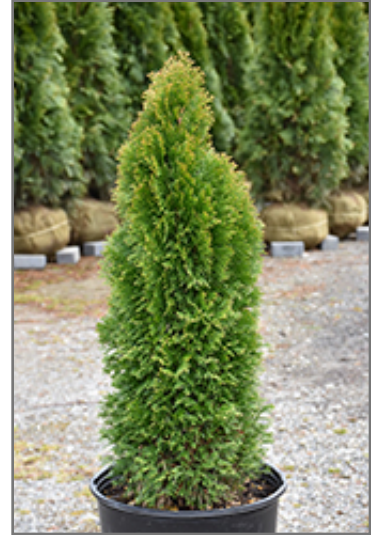
Emerald Petite Arborvitae