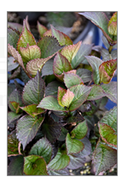
Pink Dynamo Hydrangea foliage

This is a relatively low maintenance shrub, and should only be pruned after flowering to avoid removing any of the current season's flowers. It has no significant negative characteristics.