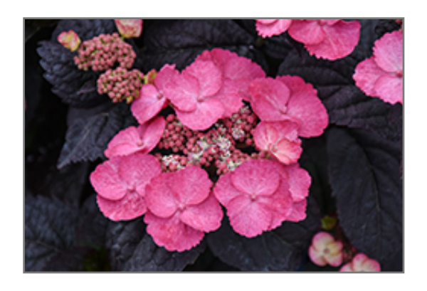
Pink Dynamo Hydrangea flowers

Pink Dynamo Hydrangea is a multi-stemmed deciduous shrub with a more or less rounded form. Its relatively coarse texture can be used to stand it apart from other landscape plants with finer foliage.