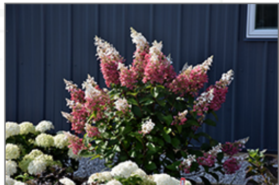
Pinky Winky Hydrangea in bloom