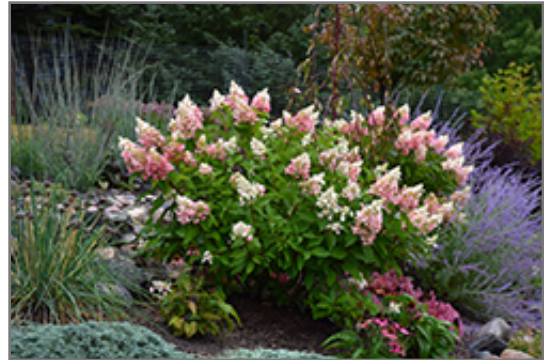
Pinky Winky Hydrangea in bloom

This shrub performs well in both full sun and full shade. It prefers to grow in average to moist conditions, and shouldn't be allowed to dry out. It is not particular as to soil type or pH. It is highly tolerant of urban pollution and will even thrive in inner city environments. Consider applying a thick mulch around the root zone in winter to protect it in exposed locations or colder microclimates. This is a selected variety of a species not originally from North America.