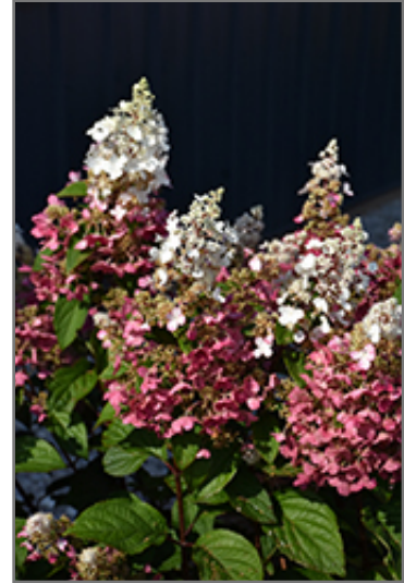
Pinky Winky Hydrangea flowers

Pinky Winky Hydrangea is recommended for the following landscape applications;