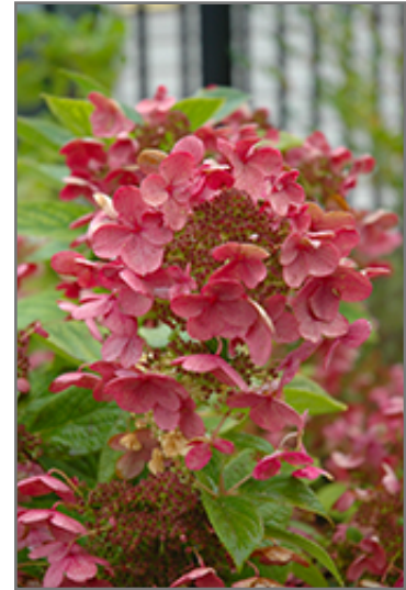
Quick Fire Hydrangea flowers (faded)

This shrub performs well in both full sun and full shade. It prefers to grow in average to moist conditions, and shouldn't be allowed to dry out. It is not particular as to soil type or pH. It is highly tolerant of urban pollution and will even thrive in inner city environments. Consider applying a thick mulch around the root zone in winter to protect it in exposed locations or colder microclimates. This is a selected variety of a species not originally from North America.