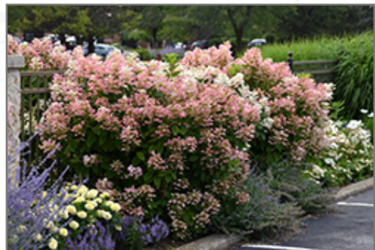
Quick Fire Hydrangea in bloom