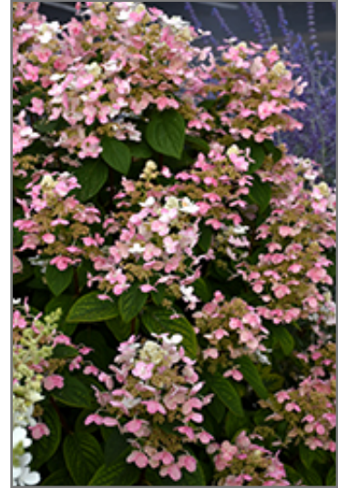
Quick Fire Hydrangea flowers

Quick Fire Hydrangea is recommended for the following landscape applications;