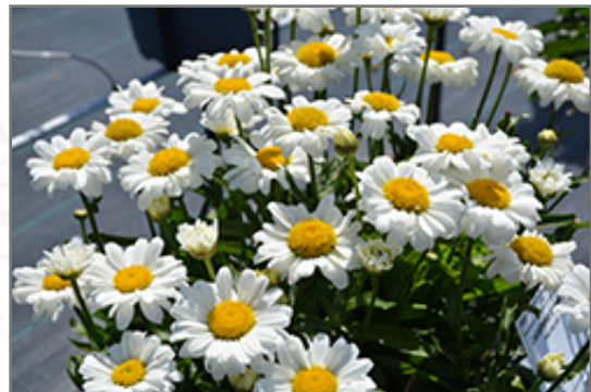
Sweet Daisy Jane Shasta Daisy flowers