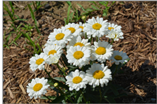
Sweet Daisy Jane Shasta Daisy in bloom