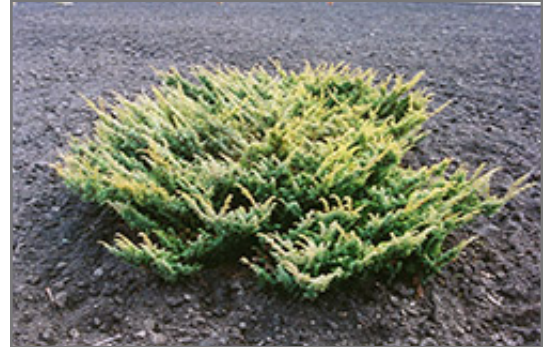
Japanese Garden Juniper