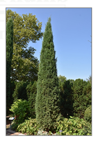
Taylor Redcedar