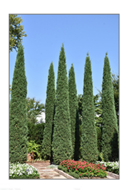
Taylor Redcedar

Taylor Redcedar is recommended for the following landscape applications;