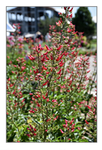
Red Birds In A Tree flowers

Red Birds In A Tree is a fine choice for the garden, but it is also a good selection for planting in outdoor pots and containers. With its upright habit of growth, it is best suited for use as a 'thriller' in the 'spiller-thriller-filler' container combination; plant it near the center of the pot, surrounded by smaller plants and those that spill over the edges. It is even sizeable enough that it can be grown alone in a suitable container. Note that when growing plants in outdoor containers and baskets, they may require more frequent waterings than they would in the yard or garden. Be aware that in our climate, most plants cannot be expected to survive the winter if left in containers outdoors, and this plant is no exception. Contact our experts for more information on how to protect it over the winter months.