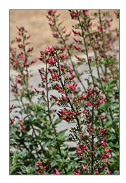
Red Birds In A Tree flowers

Red Birds In A Tree is recommended for the following landscape applications;