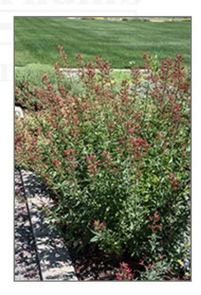
Red Birds In A Tree in bloom