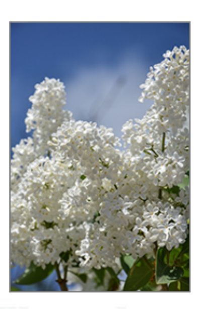
New Age White Lilac flowers

A stunning selection featuring large, fragrant white clusters that emerge in spring; upright, multi-stemmed habit; hardy and mildew resistant; ideal for screening; full sun and well-drained soil, allow room for air movement