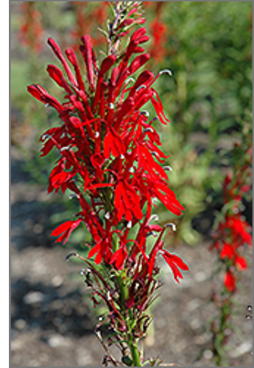
Cardinal Flower flowers