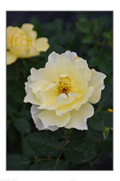
Yukon Sun Rose flowers