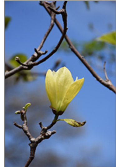
Butterflies Magnolia flowers

Butterflies Magnolia will grow to be about 20 feet tall at maturity, with a spread of 18 feet. It has a low canopy with a typical clearance of 2 feet from the ground, and is suitable for planting under power lines. It grows at a medium rate, and under ideal conditions can be expected to live for 50 years or more.