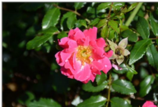
Oso Easy Double Pink Rose flowers

This shrub will require occasional maintenance and upkeep, and is best pruned in late winter once the threat of extreme cold has passed. It is a good choice for attracting bees and butterflies to your yard. Gardeners should be aware of the following characteristic(s) that may warrant special consideration;