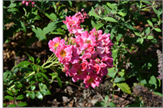
Oso Easy Double Pink Rose flowers

This shrub should only be grown in full sunlight. It does best in average to evenly moist conditions, but will not tolerate standing water. To help this plant achieve its best flowering performance, periodically apply a flower-boosting fertilizer from early spring through into the active growing season. It is not particular as to soil type or pH. It is somewhat tolerant of urban pollution. This particular variety is an interspecific hybrid.