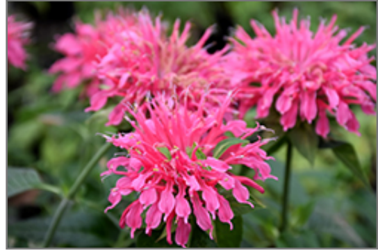
Coral Reef Beebalm flowers