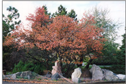
Allegheny Serviceberry in fall

Allegheny Serviceberry will grow to be about 20 feet tall at maturity, with a spread of 15 feet. It has a low canopy with a typical clearance of 4 feet from the ground, and is suitable for planting under power lines. It grows at a medium rate, and under ideal conditions can be expected to live for 40 years or more. While it is considered to be somewhat self-pollinating, it tends to set heavier quantities of fruit with a different variety of the same species growing nearby.