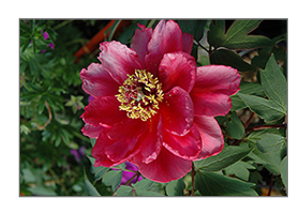
Shimanishiki Tree Peony flowers

A beautiful woody peony for the garden collector, with bold flowers in a rich reddish-purple with prominent streaks of white in spring, great as an accent in the garden; unlike perennial peonies, remember not to prune this variety