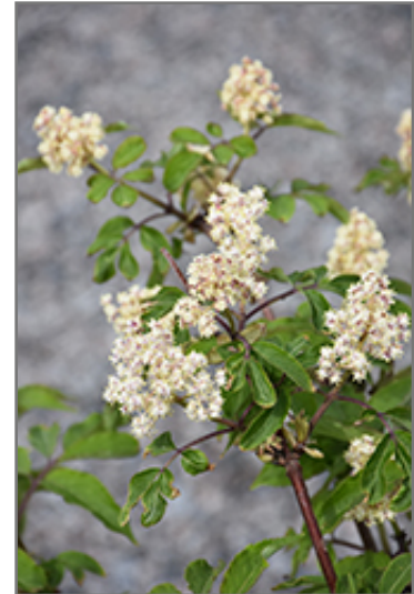
Red Elderberry flowers

Red Elderberry is recommended for the following landscape applications;