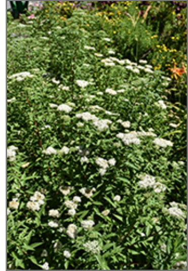
Meadowsweet flowers

Meadowsweet is recommended for the following landscape applications;