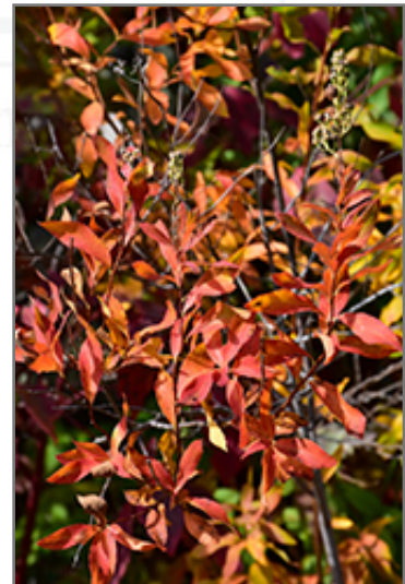
Meadowsweet in fall