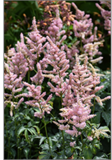
Peach Blossom Japanese Astilbe flowers

Beautiful delicate peach blossoms with hints of pink are produced on upright, sturdy stems. blooms early in the summer; an excellent choice for garden beds, borders and containers; great cut flower either fresh or dried; low maintenance and easy to grow