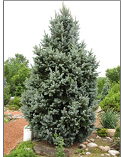
Iseli Fastigiata Spruce

This is a relatively low maintenance tree. When pruning is necessary, it is recommended to only trim back the new growth of the current season, other than to remove any dieback. Deer don't particularly care for this plant and will usually leave it alone in favor of tastier treats. It has no significant negative characteristics.