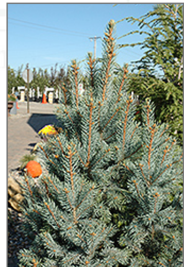
Iseli Fastigiata Spruce foliage