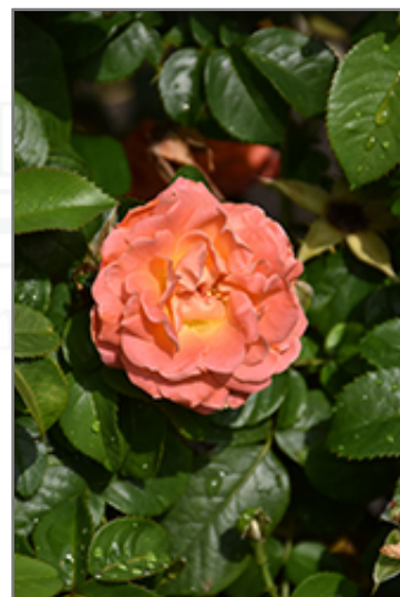
Orange Glow Knock Out Rose flowers