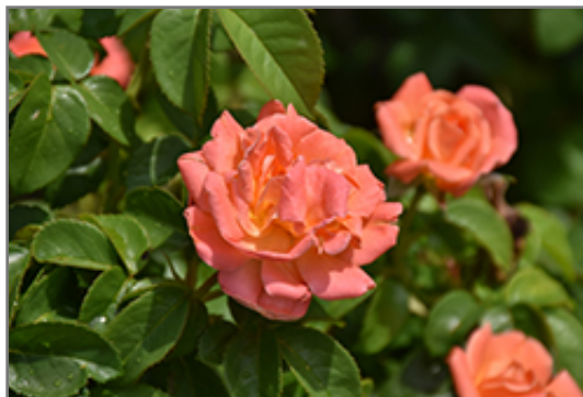
Orange Glow Knock Out Rose flowers

Orange Glow Knock Out Rose is a multi-stemmed deciduous shrub with a more or less rounded form. Its average texture blends into the landscape, but can be balanced by one or two finer or coarser trees or shrubs for an effective composition.