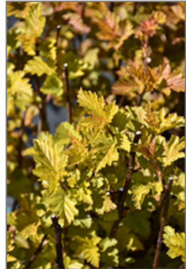
Savannah Sunset Ninebark foliage

This shrub does best in full sun to partial shade. It is very adaptable to both dry and moist locations, and should do just fine under average home landscape conditions. It is not particular as to soil type or pH. It is highly tolerant of urban pollution and will even thrive in inner city environments. This is a selection of a native North American species.