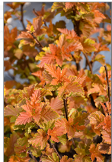
Savannah Sunset Ninebark foliage