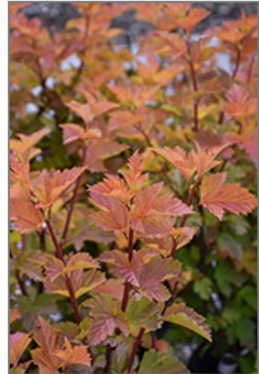
Savannah Sunset Ninebark foliage

Savannah Sunset Ninebark is recommended for the following landscape applications;