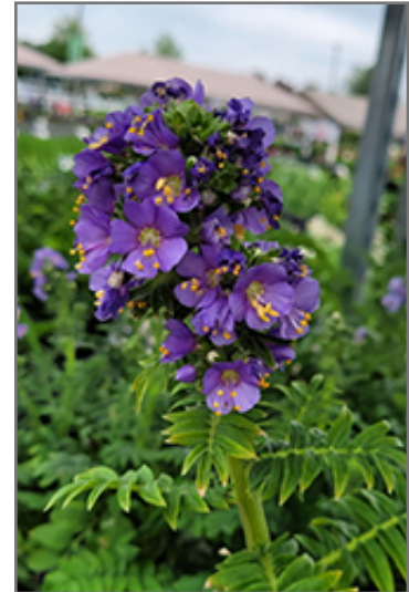
Heavenly Habit Jacob's Ladder flowers

Heavenly Habit Jacob's Ladder has masses of beautiful spikes of lightly-scented lilac purple star-shaped flowers with white eyes and yellow anthers rising above the foliage from mid spring to mid summer, which are most effective when planted in groupings. The flowers are excellent for cutting. Its ferny pinnately compound leaves remain dark green in colour throughout the season.