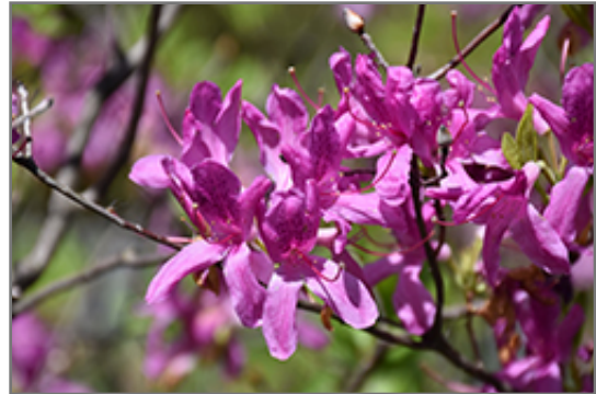
Lilac Lights Azalea flowers

Lilac Lights Azalea is recommended for the following landscape applications;