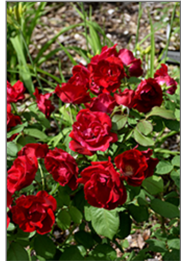
Emily Carr Rose flowers