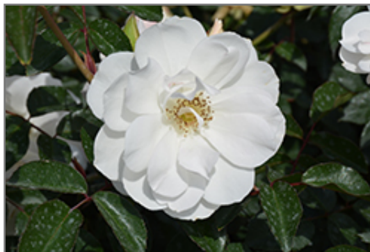
Iceberg Rose flowers

This shrub will require occasional maintenance and upkeep, and is best pruned in late winter once the threat of extreme cold has passed. Gardeners should be aware of the following characteristic(s) that may warrant special consideration;