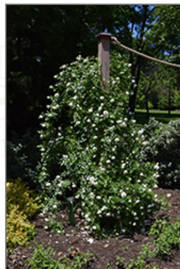
Iceberg Rose in bloom