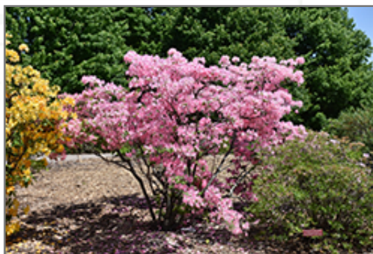
Northern Lights Azalea in bloom