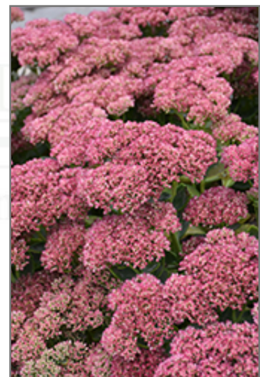
Autumn Fire Stonecrop flowers